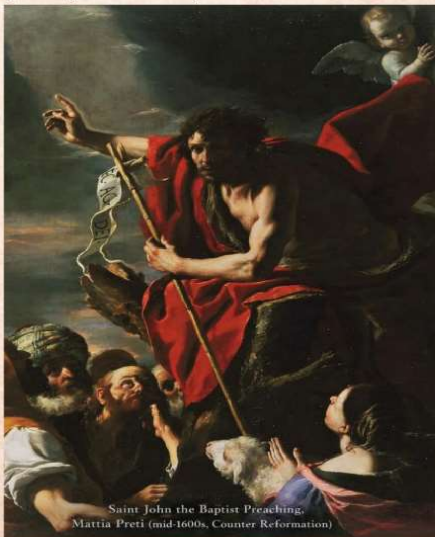
Saint John the Baptist Preaching, Mattia Preti (mid-1600s, Counter Reformation)

For January, the Pope invites the Church to focus on prayer with the Word of God. He reminds us that Sacred Scripture is not meant to stay on the page but to be prayed with, lived, and allowed to take root in our daily lives. By spending time with God's Word, we are nourished in faith and strengthened in hope, so that our communities may be renewed by the light of the Gospel.